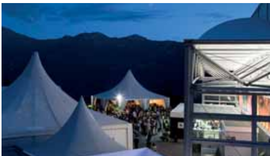
The Salle des Combins.